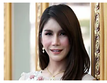
Nur Sajat not above the law, says Deputy Minister | New Straits Times New Straits Times