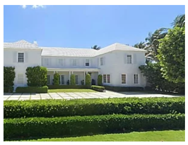
Trumps Aim for Hefty Profit Over 50? You Have to Try on $49 Million Palm Beach, Florida, Mansion