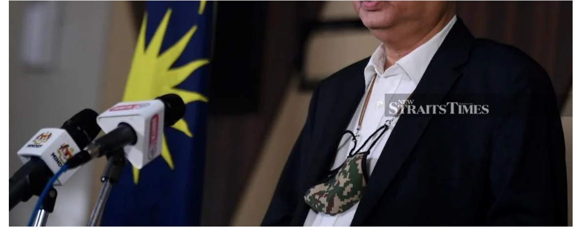
Senior Minister (Security Cluster) Datuk Seri Ismail Sabri Yaakob said Malaysia has its own National Covid-19 Immunisation Programme (NIP), which rolled out recently to provide vaccines for the whole country.