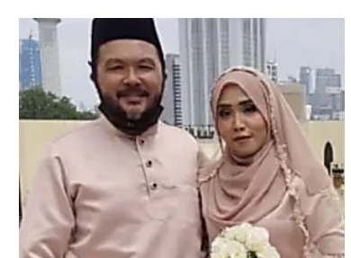
#Showbiz: Gerak Khas's 'Detective Lim' ties the knot at 55 | New Straits Times New Straits Times