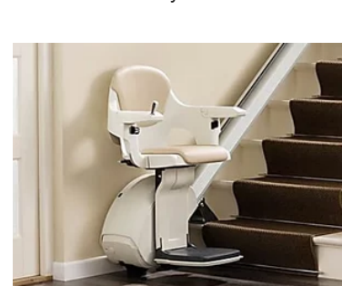
Petaling Jaya Could Surprise You Sponsored | Stair Lift | Sponsore...